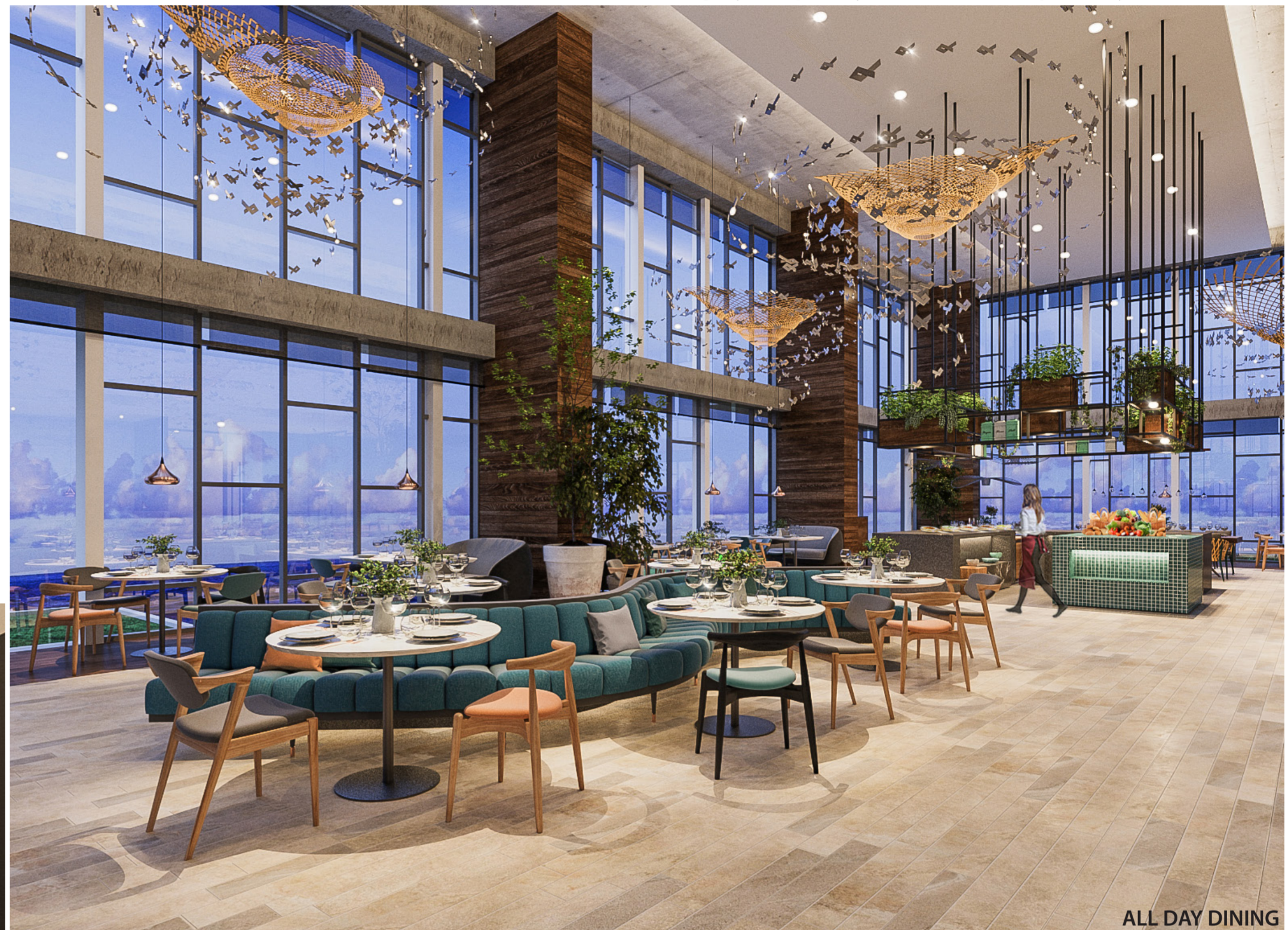
ALL DAY DINING

On the twenty second floor is the executive lounge, provides high-class service for the Suites and Presidential Suites. It can be used for different activities like having breakfast, relaxing or client meeting. Design is flexible, casual, multi-functional and maximizes utilities within a small space. All wooden furniture is comfortable but still of high quality, top-notch equipments.