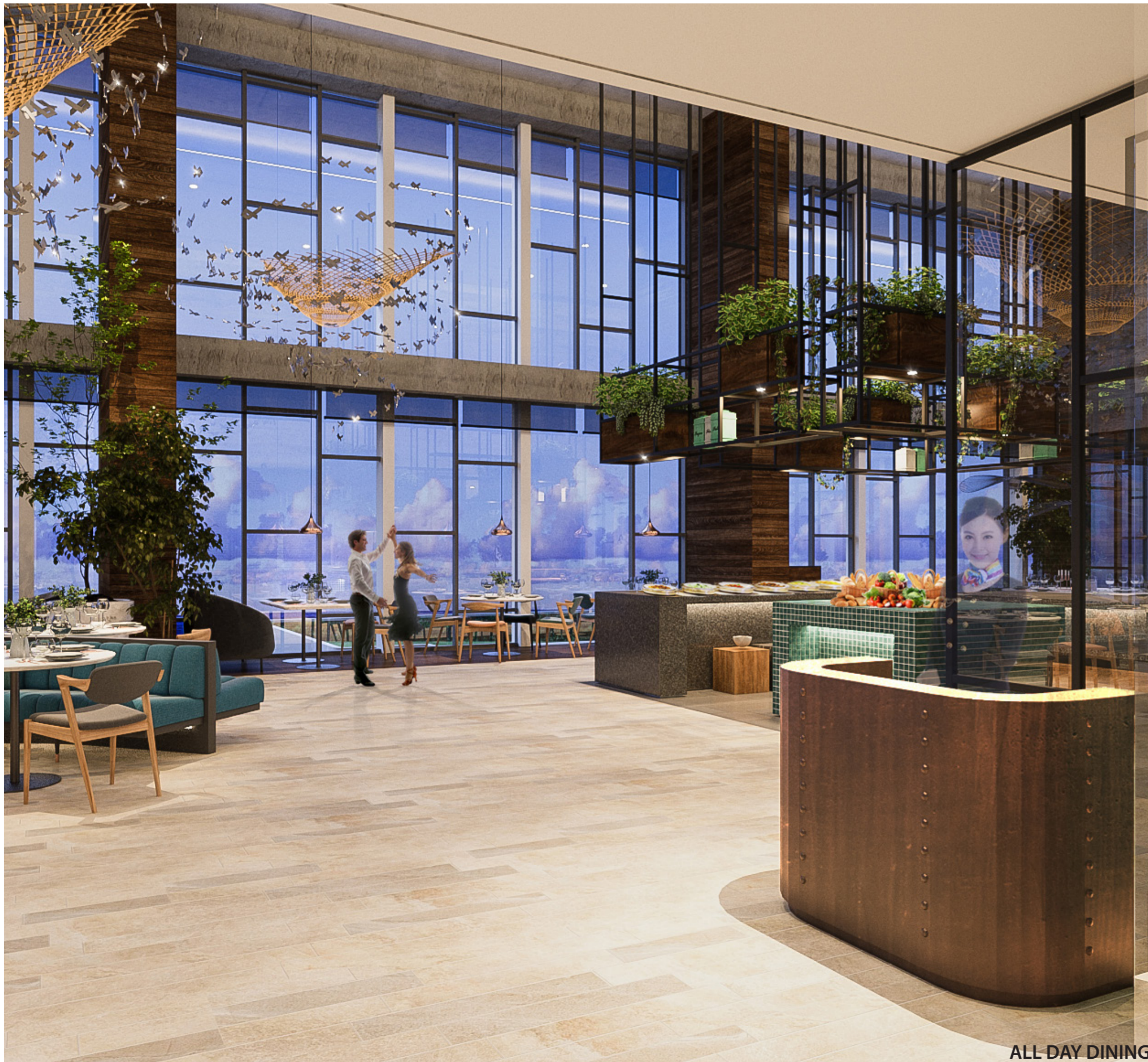
ALL DAY DINING