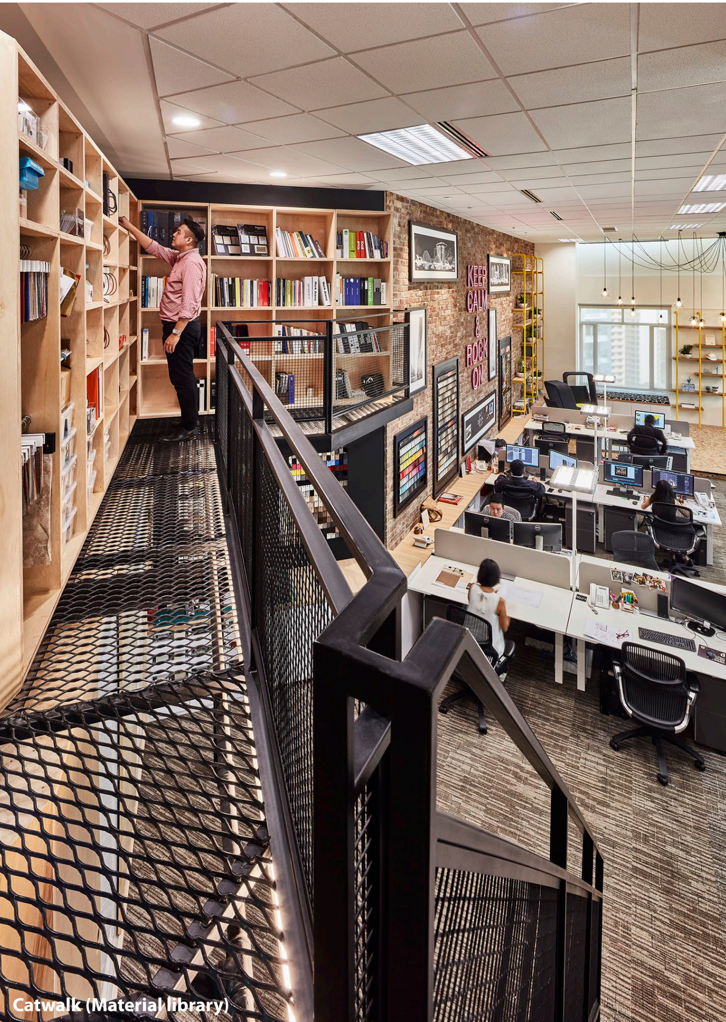
Catwalk (Material library)